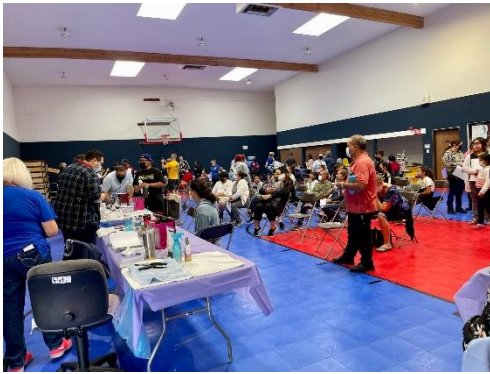
Treblemakers helped out at the La Habra Vision Screening Fair.